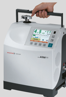
Highly portable with retractable handle