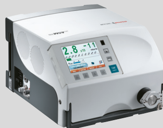
Can be operated in any position

Light weight and universal voltage enable the ASM 310 to be easily operated anywhere in the world. A transport case to safeguard against shipping damage as well as a trolley are available as accessories.