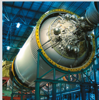
Analytical instrumentation and research