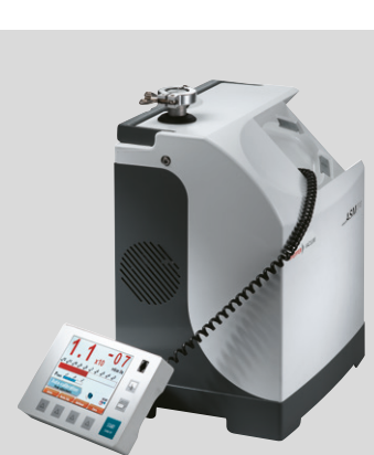
Detachable control panel (with approx. 2 m cable)